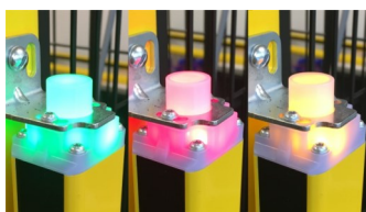
Status LED endcap