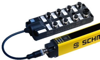
Muting sensor connection unit