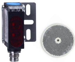
Reflective muting sensor