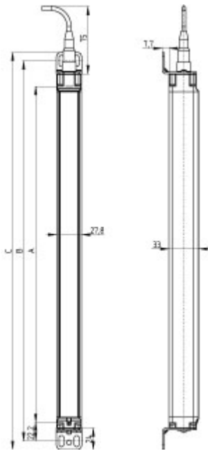
Dimensional drawing (basic component)