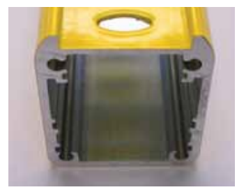
Rugged closed housing profile