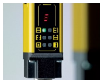
7 segment & LED display