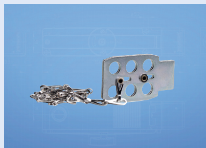
Lockout tag SZ150-1 To prevent inadvertent closing, e.g. during maintenance