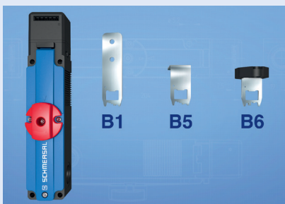
Actuators for all mounting situations B1 (straight), B5 (angled), B6 (flexible)

Solutions for a broad range of applications