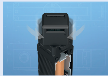
Rotating actuator head Actuator head can be rotated without loosening of screws