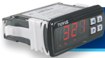
GENERAL COOLING / HEATING