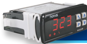
REFRIGERATION THERMOSTAT WITH DEFROST