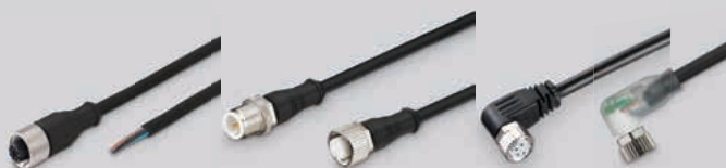
Connection and interconnection cables M8 and M12

Various materials and function ranges offer an appropriate solution for every application.