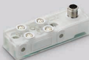
Distribution box M8 ports