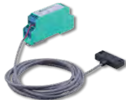
Temperature hub and sensor

The dustproof enclosure and I.S. termination board are accessories that complement the functionality of the component kits.